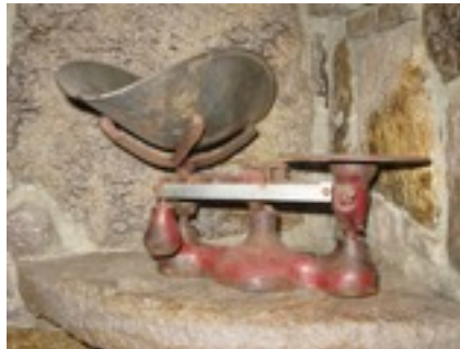
photos taken at Olympia's Apple Orchard during Apple Pie Workshops, this Fall

The one time of year for making a concession on the locavore's fruit shopping list is surely Thanksgiving. Cranberries from the bogs of Massachusetts, when paired with a basket of sliced Gravensteins make for a heavenly holiday pie. Serve with a scoop or two of your choice of these terrific, locally produced ice creams: Laloos Goat Milk ice cream, Three Twins Organic, Clover Stornetta and Strauss Family Dairy.